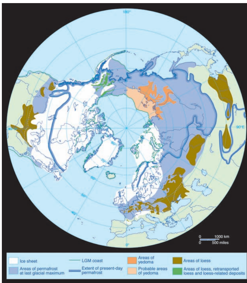
Fig. 1. Current and probable LGM regions of loess, loess-related deposits, and yedoma mapped in relation to the modern and LGM distribution of permafrost. Information sources are provided in the SOM text. Modern and LGM coasts are shown, the latter approximated from the modern 120-m isobath (30). The map indicates that considerable areas of loess would have been frozen at the LGM and subsequently thawed, and yedoma would have extended northward on the exposed Siberian shelf.

We develop this third alternative hypothesis (thermokarst-lake hypothesis): CH 4 ebullition (bubbling) from newly formed thermokarst lakes occurred extensively across large unglaciated regions in northern high latitudes, particularly in Siberia, as the climate became warmer and wetter. Thermokarst-lake CH 4 emissions are distinct from those of wetlands because thermokarst lakes are a distinctive ecosystem type (13) not typically included in wetland emission estimates (17) and because ebullition, which dominates CH 4 emissions from thermokarst lakes, is a substantially larger source of CH 4 than previous-