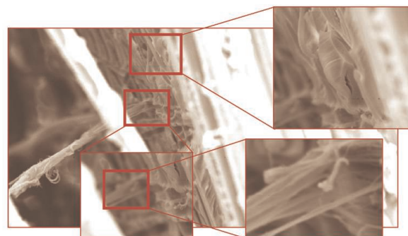
A pathway to supernanocomposites? (Left) Advanced laminated composite with nanofiber-reinforced interfacial layer. (Right) In situ observation of interlaminar toughening nanomechanisms including Velcro-like crack bridging by nanofibers.